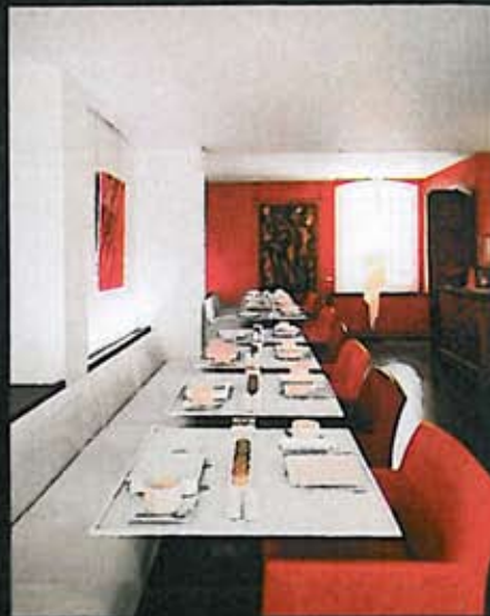
Take the champagne breakfast at Hôtel Cézanne.

Cézanne devotees will cherish the rows of chestnut trees, farm buildings, and fountains at the Bouffan estate—he painted them all. The artist was 20 when his father bought the two-story manor in 1859, and it was opened in 2006 for the centenary. Cézanne look over the main drawing room, painting directly onto the walls, and a film recreates the effect. More renovations here are on the horizon. Arrange a visit through the tourism office. 33/442-161-161